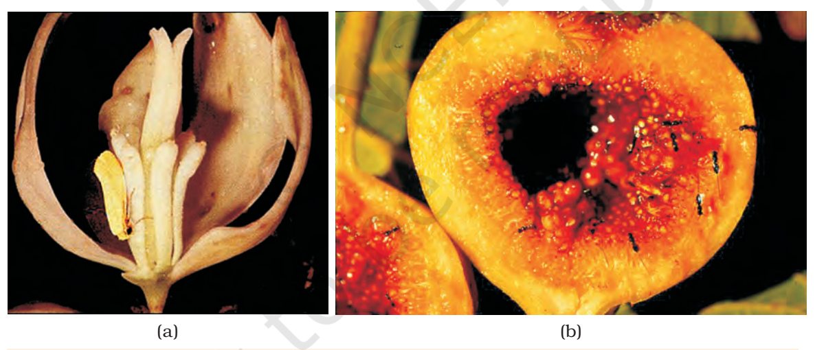
Figure 11.4 Mutual relationship between fig tree and wasp: (a) Fig flower is pollinated by wasp; (b) Wasp laying eggs in a fig fruit

(v) Mutualism: This interaction confers benefits on both the interacting species. Lichens represent an intimate mutualistic relationship between a fungus and photosynthesising algae or cyanobacteria. Similarly, the mycorrhizae are associations between fungi and the roots of higher plants. The fungi help the plant in the absorption of essential nutrients from the soil while the plant in turn provides the fungi with energy-yielding carbohydrates.