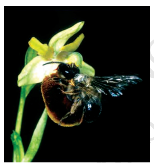
Figure 11.5 Showing bee-a pollinator on orchid flower

The most spectacular and evolutionarily fascinating examples of mutualism are found in plant-animal relationships. Plants need the help of animals for pollinating their flowers and dispersing their seeds. Animals obviously have to be paid 'fees' for the services that plants expect from them. Plants offer rewards or fees in the form of pollen and nectar for pollinators and juicy and nutritious fruits for seed dispersers. But the mutually beneficial system should also be safeguarded against 'cheaters', for example, animals that try to steal nectar without aiding in pollination. Now you can see why plant-animal interactions often involve co-evolution of the mutualists, that is, the evolutions of the flower and its pollinator species are tightly linked with one another. In many species of fig trees, there is a tight one-to-one relationship with the pollinator species of wasp (Figure 11.4). It means that a given fig species can be pollinated only by its 'partner' wasp species and no other species. The female wasp uses the fruit not only as an oviposition (egg-laying) site but uses the developing seeds within the fruit for nourishing